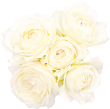
Princess Fairy Kiss White