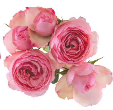
Mansfield Park Pink