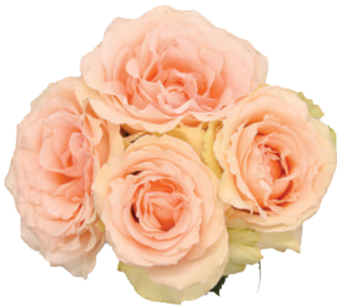
Alina Perfumella Spray