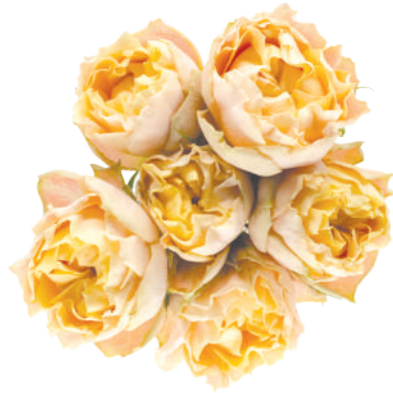
Princess Little Joa