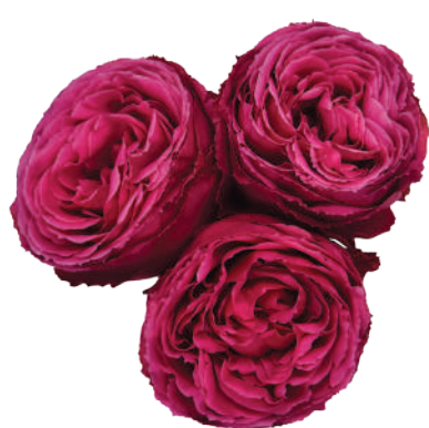
Hot Pink Lace