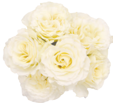
4 Good White