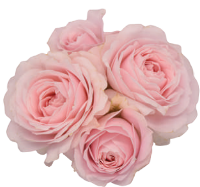
Princess Fairy Kiss Pink