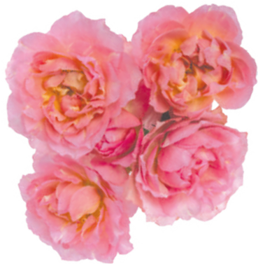
Julietta Pretty Pink