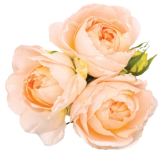
Princess Aiko Spray