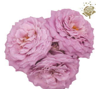
Princess Kaori Spray