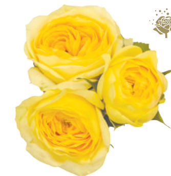
Lemon Pom Pom