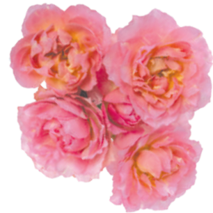
Julietta Pretty Pink