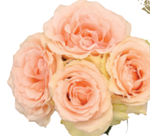
Alina Parfumella Spray