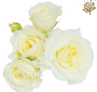
Princess Hoshi Spray