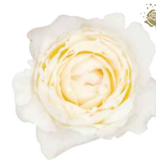
Cream Yves Piaget