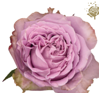
Princess Kaori Single