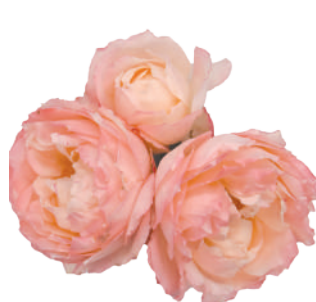
Princess Suki Spray

To order please get in touch with tambuzi.sales@tambuzi.co.ke