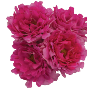
# New Look