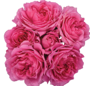
Princess Meiko Spray